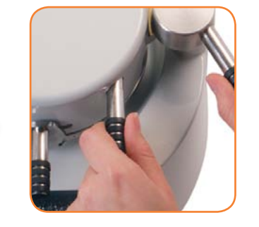
After heating time has elapsed, swivel pressure chamber over the model and close locking handle.