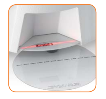
Material parameters can be registered by scan technology